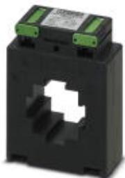
Window-type current transformer, 300 A AC primary current; 5 A AC secondary current; accuracy class 1; 7.5 VA rated power

Please be informed that the data shown in this PDF Document is generated from our Online Catalog. Please find the complete data in the user's documentation. Our General Terms of Use for Downloads are valid ( http://phoenixcontact.com/download )