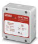
Surface-mounted housing with surge protection, for RS-485 interface with with TTL level, mains connection with slot for protective plug PRT-S... (without protective plug)

Surge protection device - BXT-M/RS485-TTL - 2749987